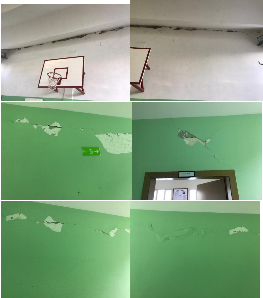
Milot High School:

This project is funded by the European Union