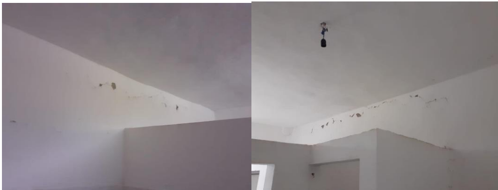
“Kolin Gjoka” Vocational High School