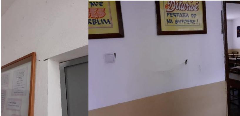
“At Shtjefën Kurti” High School:

This project is funded by the European Union